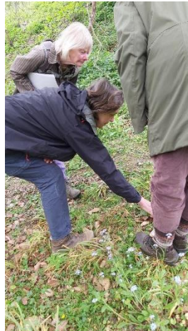
Botanical survey in action – looking for evidence of ancient woodland plants