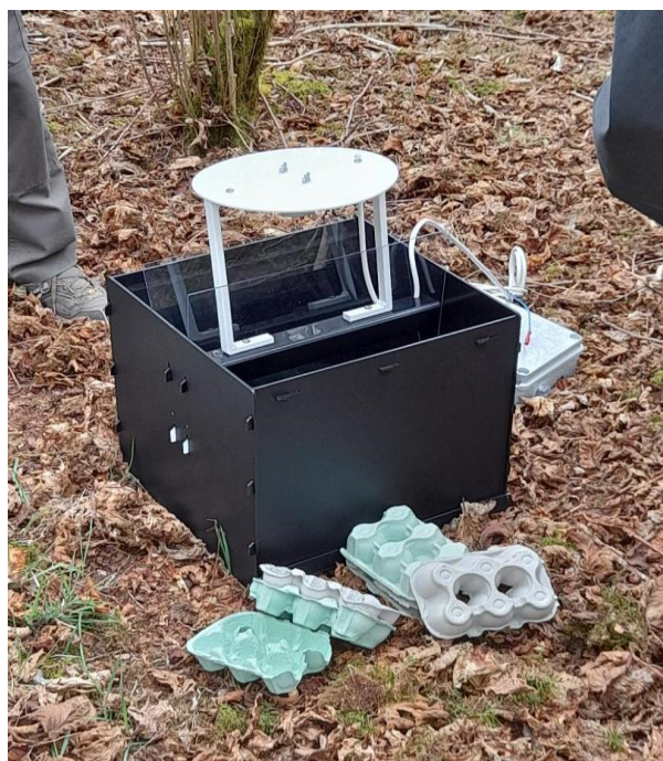
Pete and Ginny Clarke showing the Woodlanders how to set up the moth trap