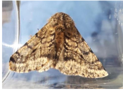
Two of the moths collected overnight